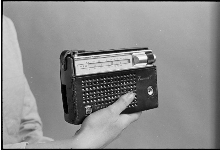
Figure 2. “Transistor” was the nickname of the transistor based radio during the 1960s and 1970s [2]. (Note that reference [2] appears again— since we here bring forward a new statement, based on the same reference; however, not really connected to the previous statement.)

(Well this didn't look nice! To end the section with a figure alone on a page is not good. Try to rearrange when this happens.)