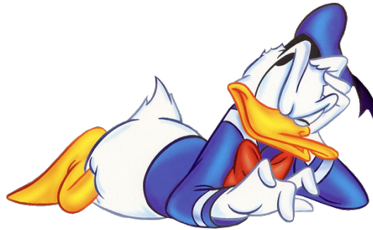
Figure 1. The inventor of electronics [2].

Should a sentence begin with a figure reference the full word is written out like this: “Figure 1 shows ...”